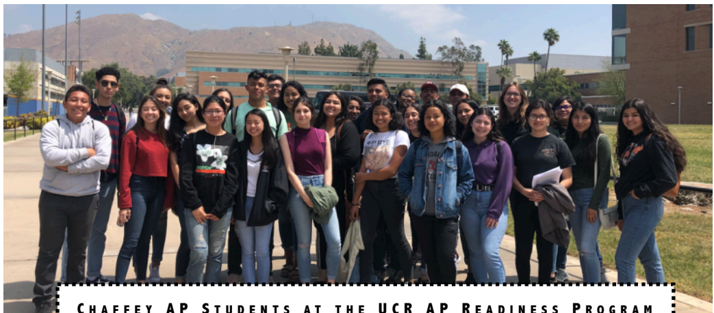
CHAFFEY AP STUDENTS AT THE UCR AP READINESS PROGRAM

DO YOU HAVE AN IDEA FOR THE GATE NEWSLETTER? LET US KNOW! HOLLACE.BRAYER@CJUHS.D.NET