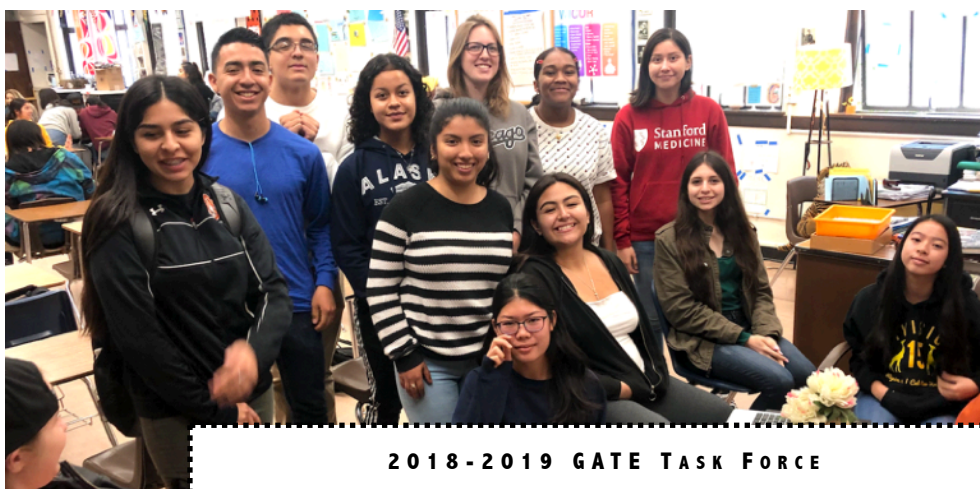
2018-2019 GATE TASK FORCE

Every student who registered for any AP or honors course was invited to an orientation . Parents and guardians learned about the GATE program and course offerings while students attended information sessions about courses and workload. The AP and honors students upperclassmen offered sage advice on time management, handling stress, and the value of